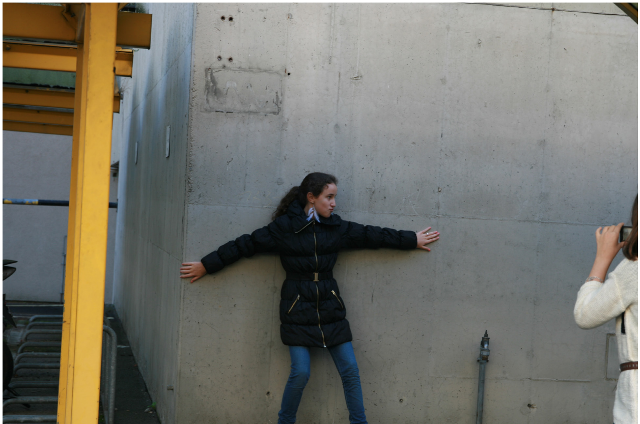
Photoshoot session