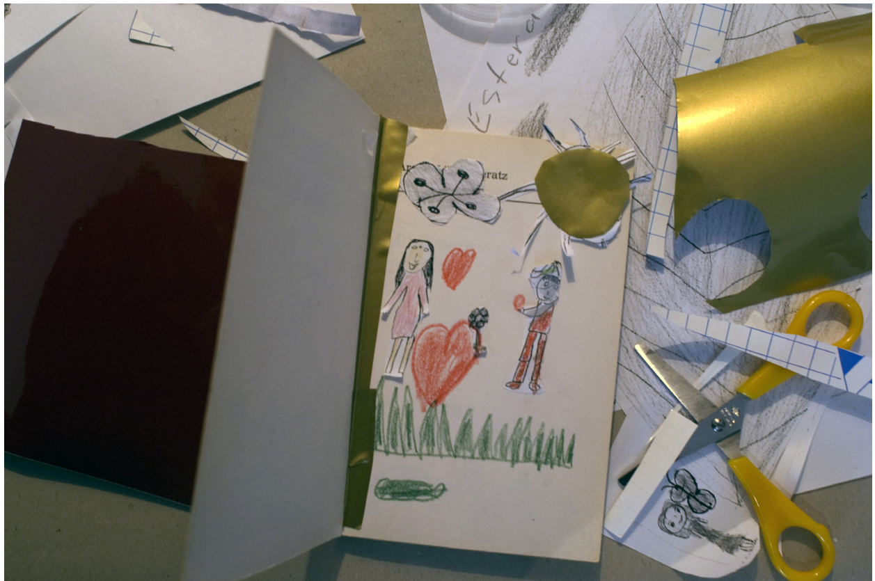
Book in the making at the collage workshop