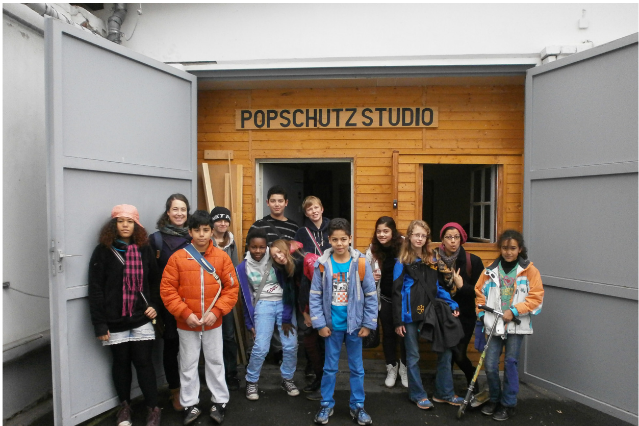
The group at Popschutz Studio