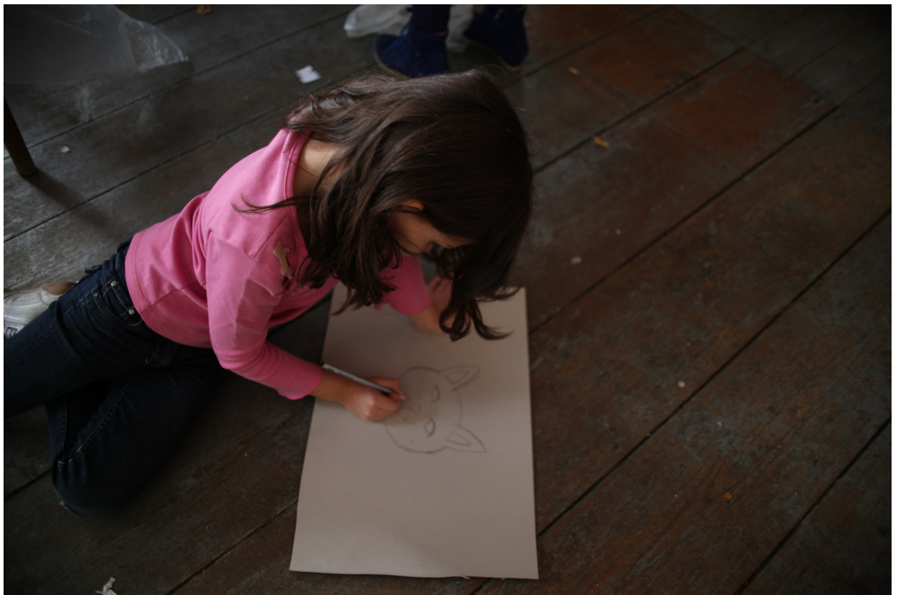
Drawing at the mask workshop