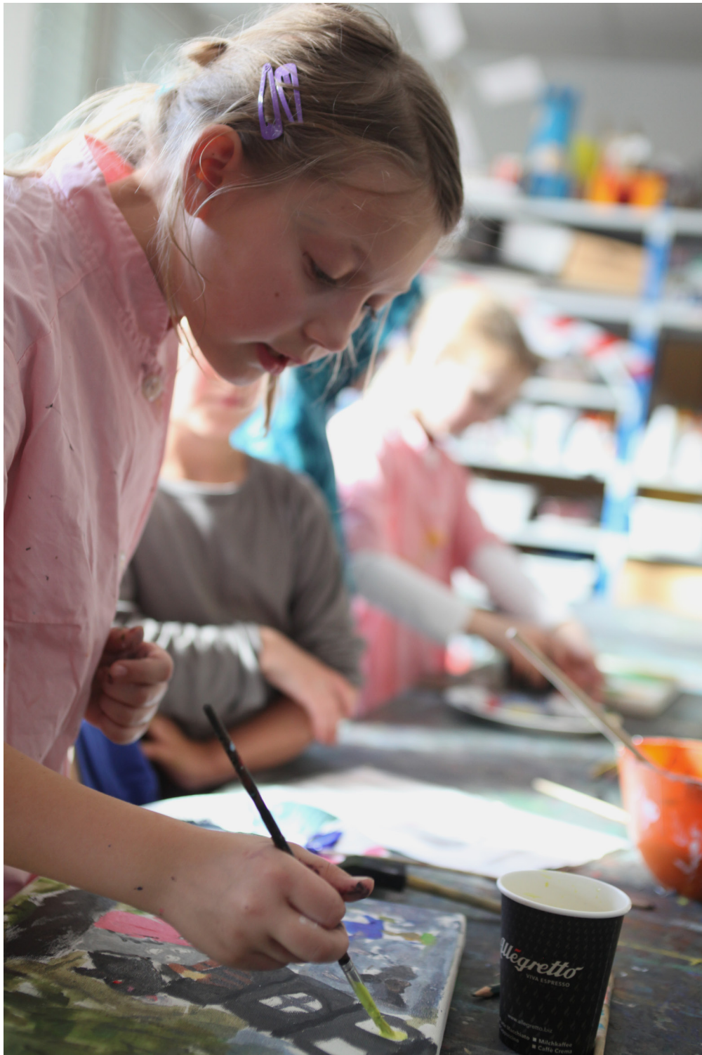
Painting at the workshop