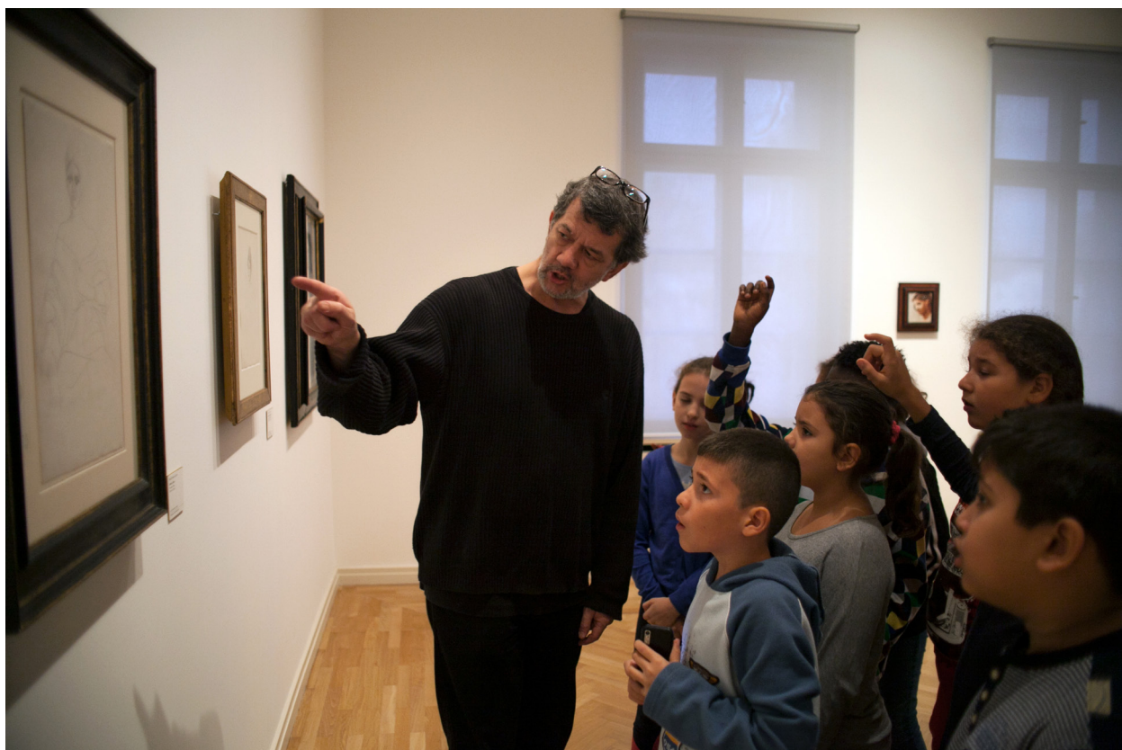
At the tour of the Berggruen Collection