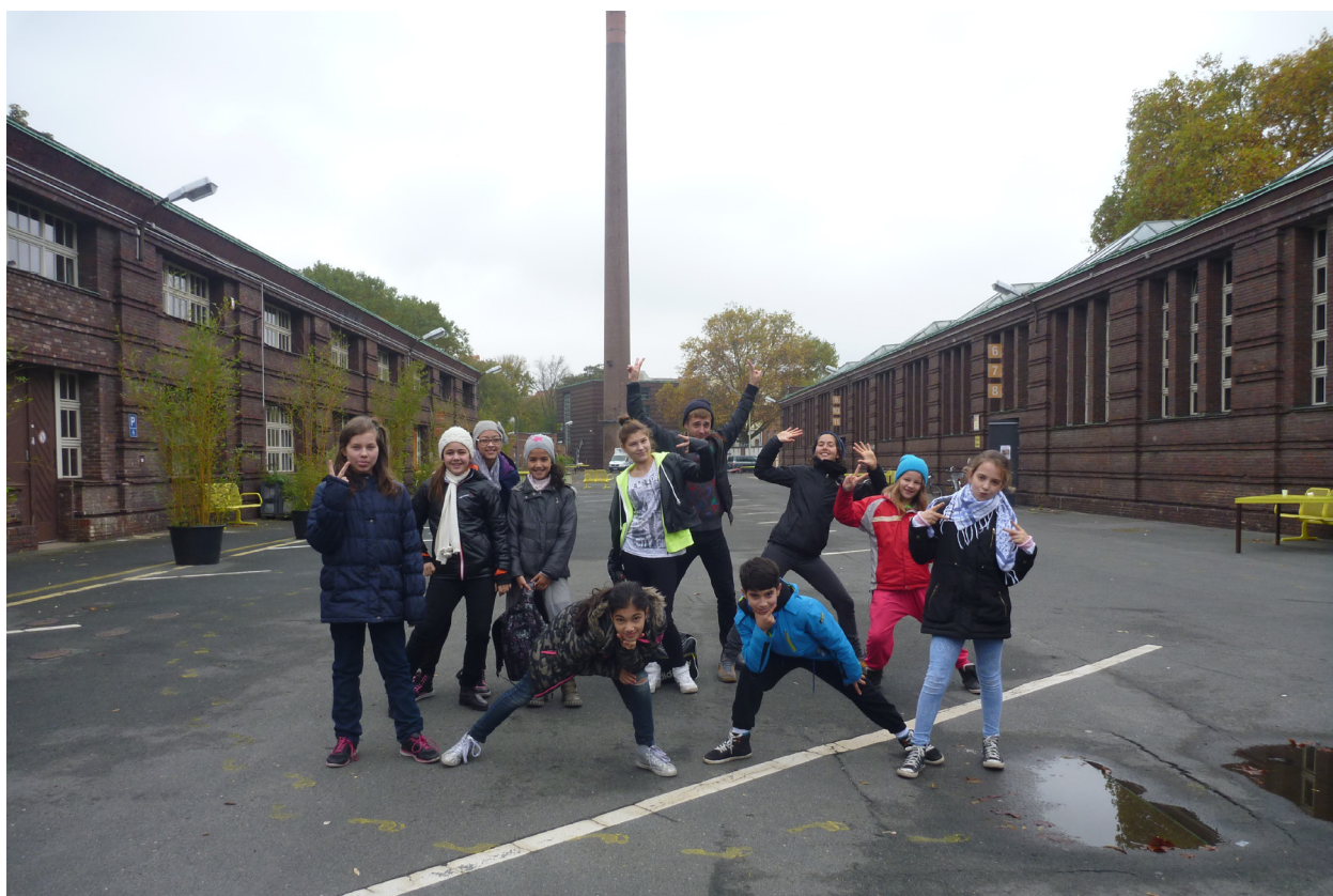
The group