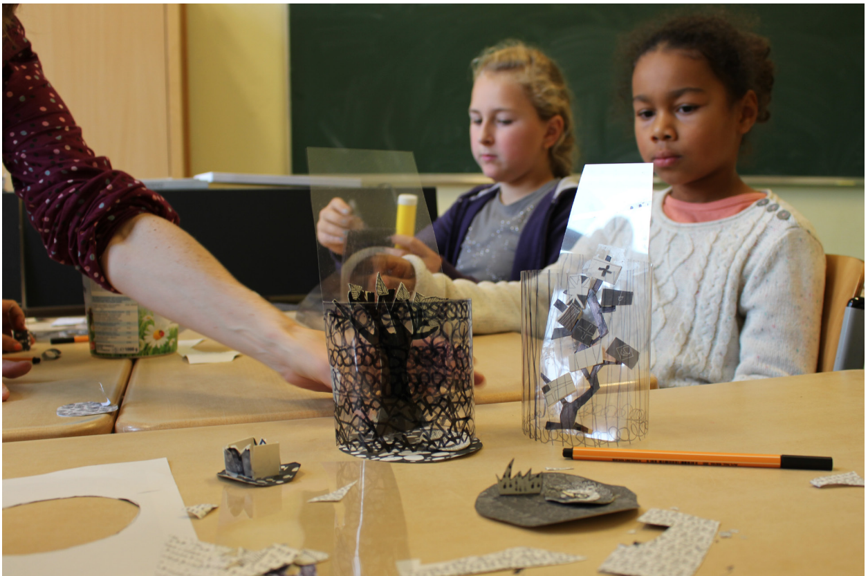
Light - box in the making