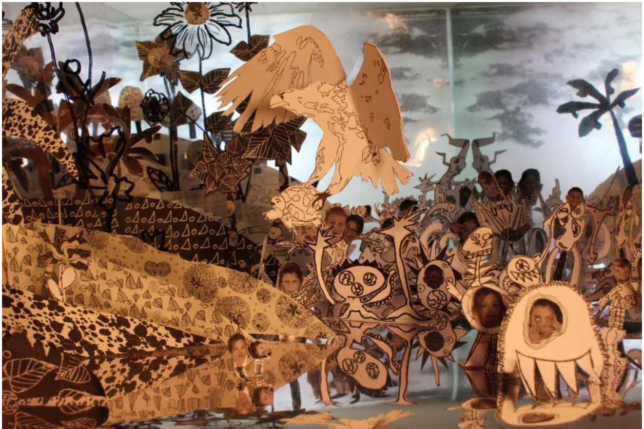
Light - box 1