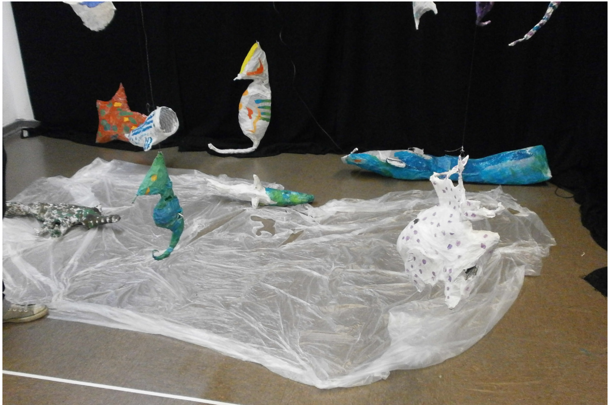
Final sculptures