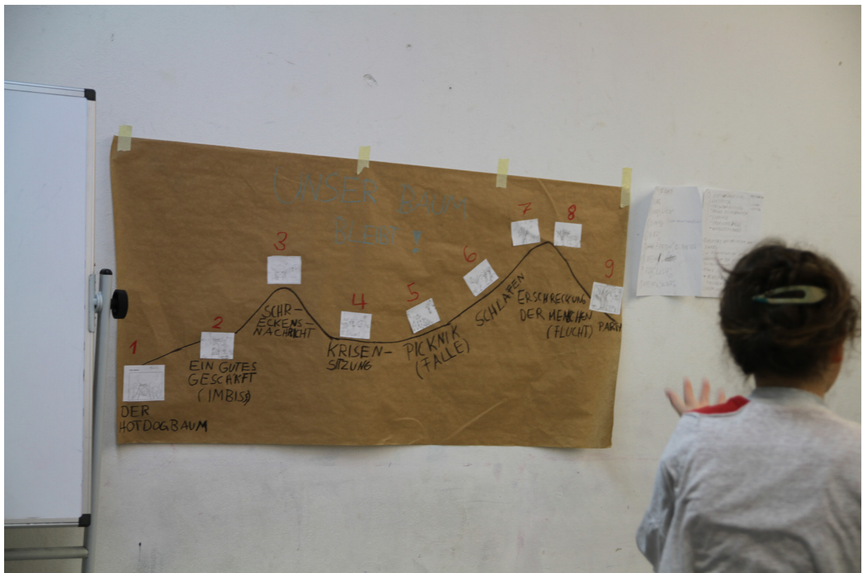
The storyboard