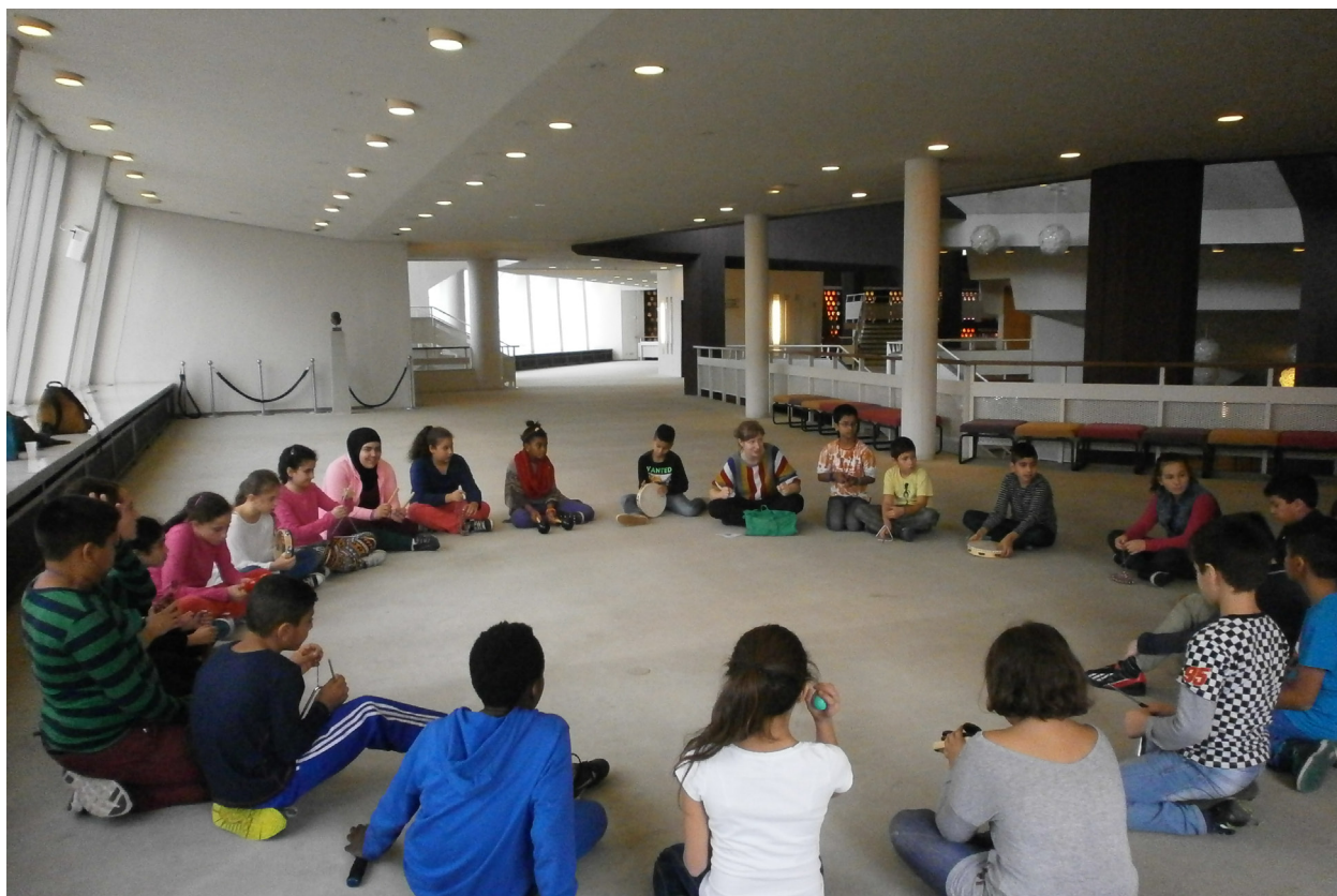
At the Berlin Philharmonic