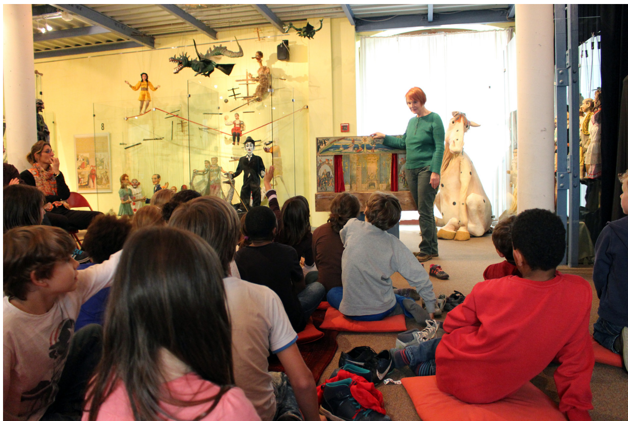
At the puppet Museum