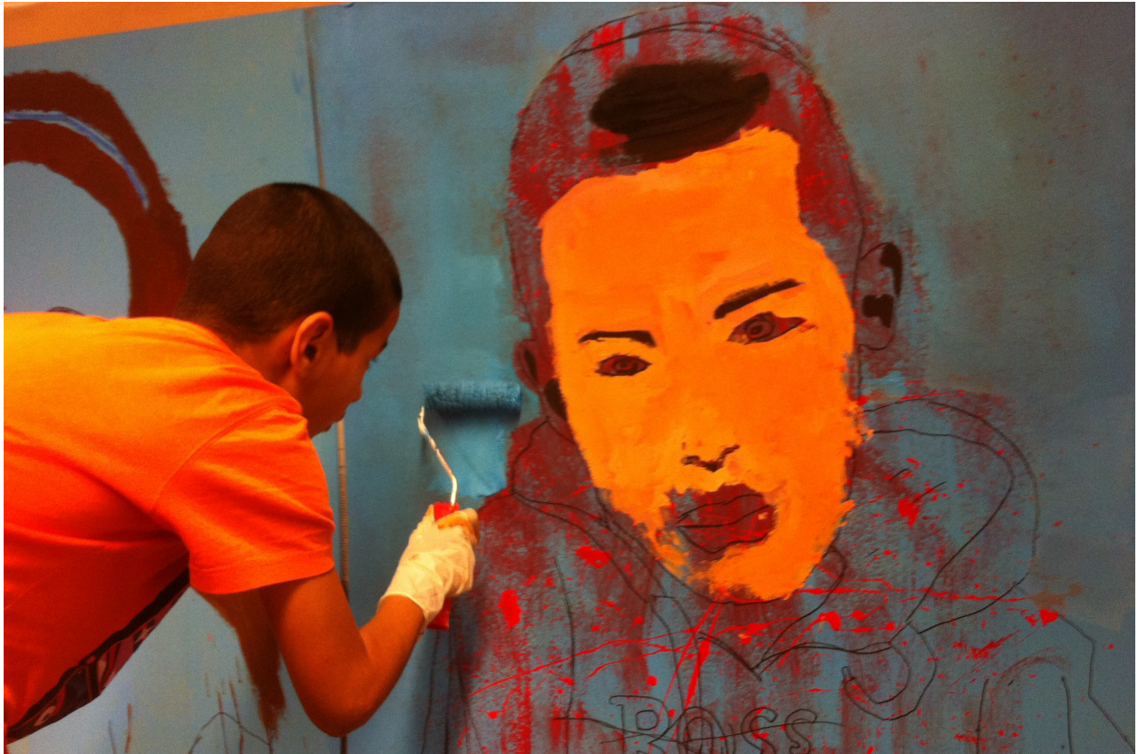
Selfie in the making