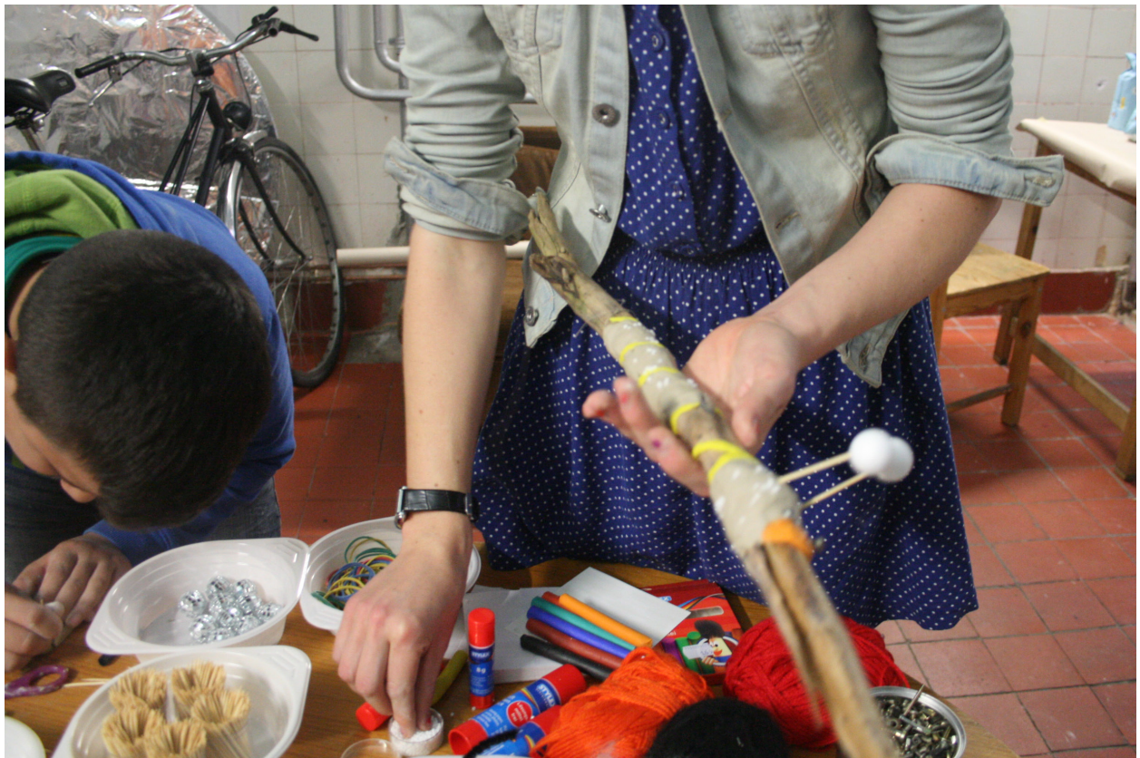
Workshop 1