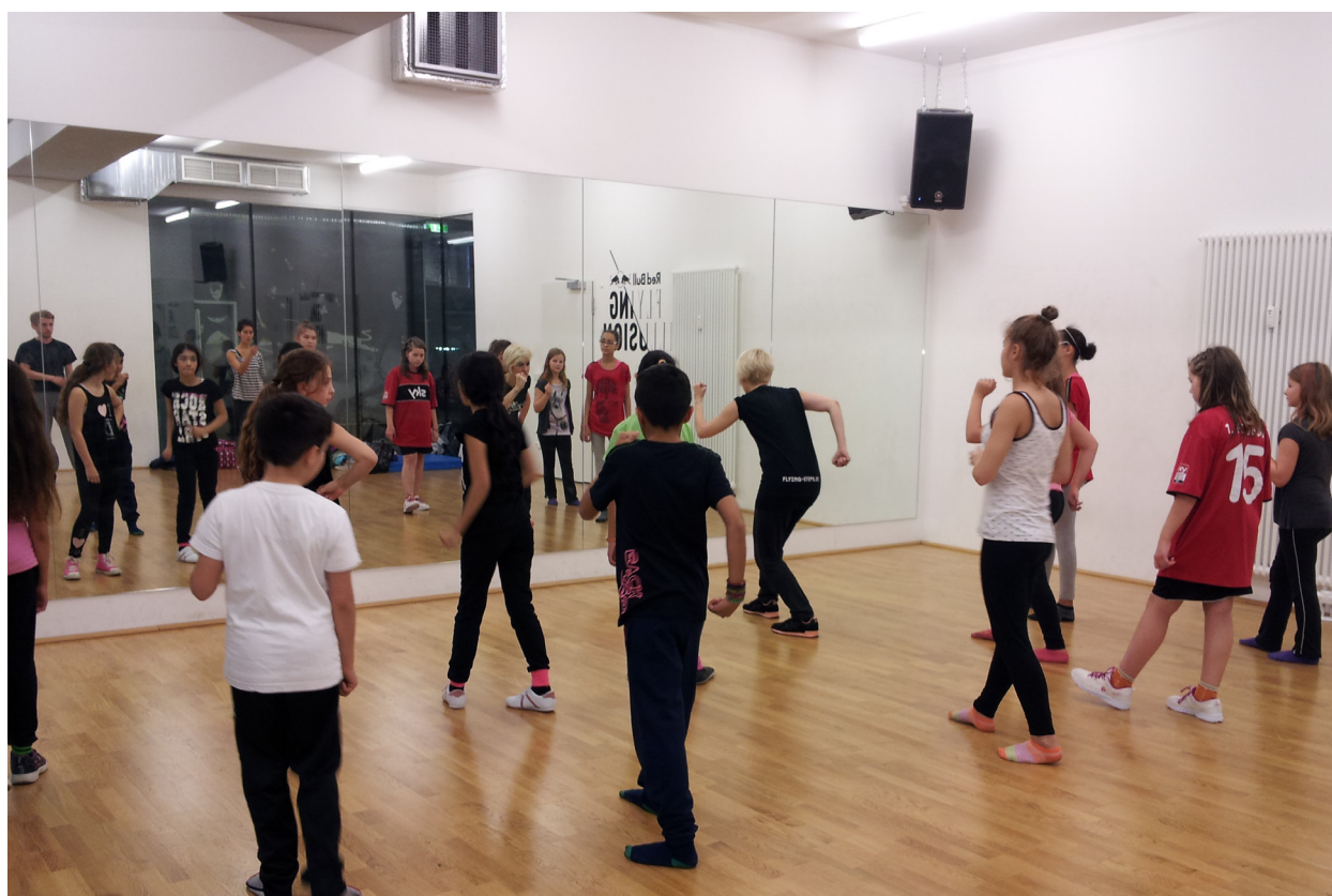
Workshop at the Flying Steps Academy