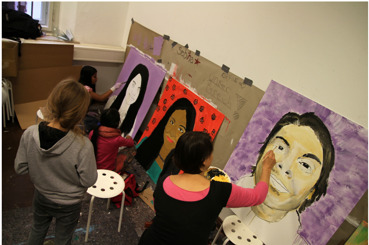
Selfies at the workshop