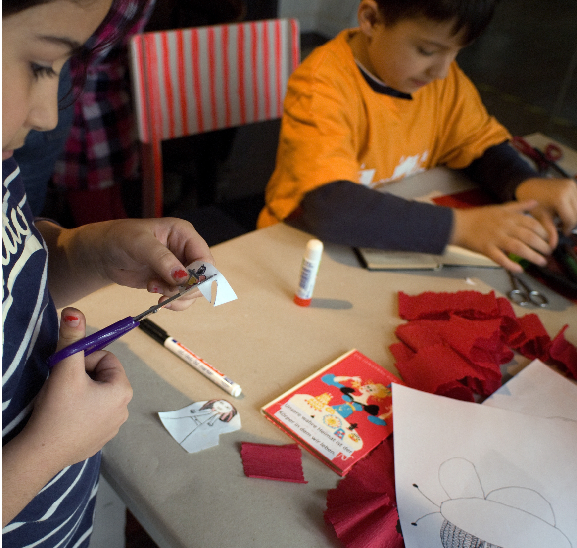
Workshop / Photo: Isaumir Nascimento