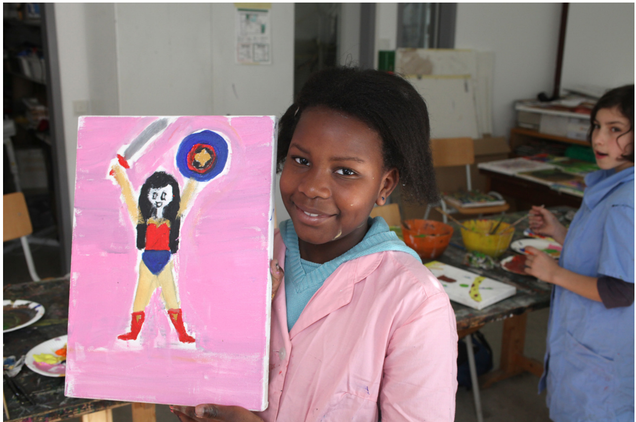
A final piece at the workshop