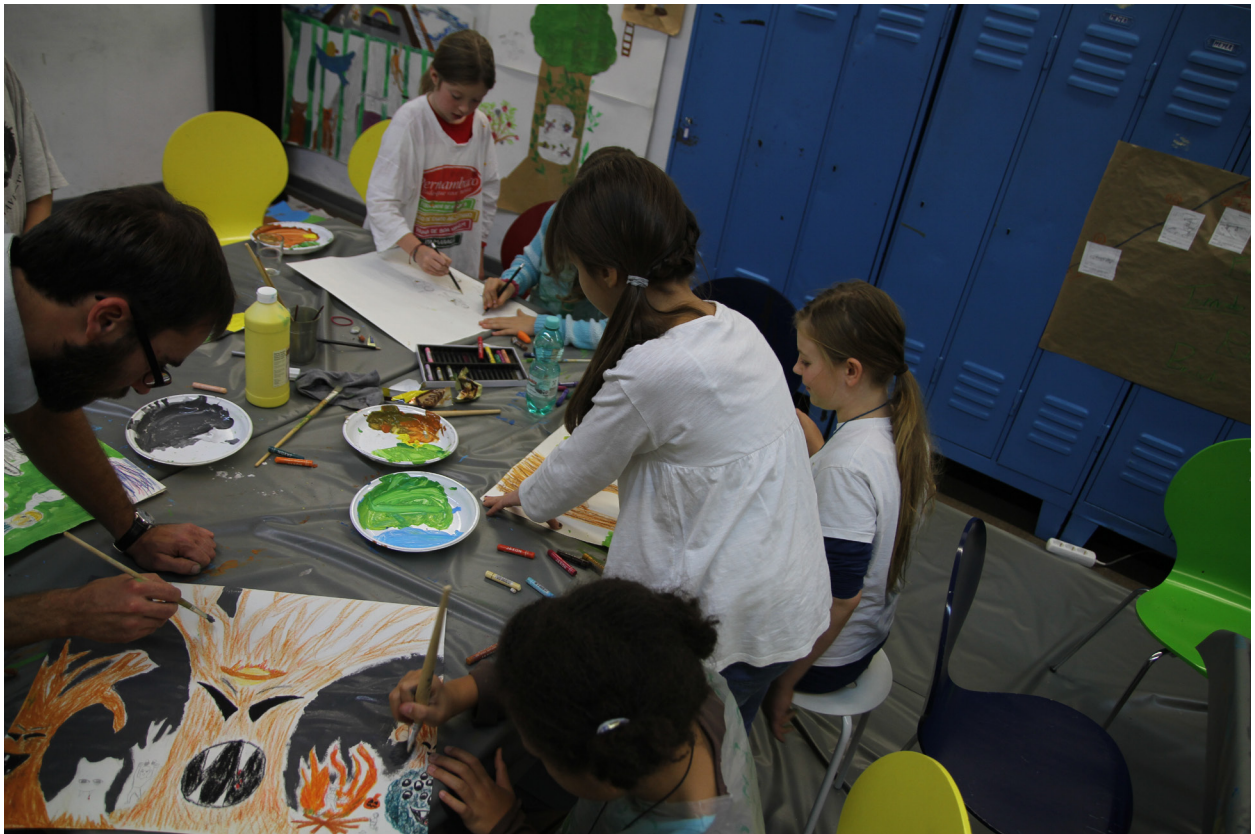
At the workshop