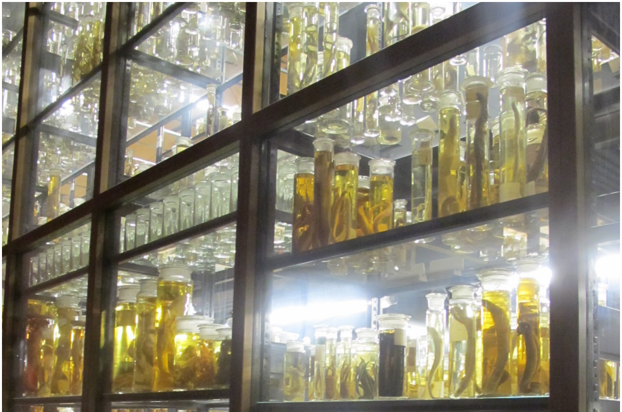
Visit at the Natural History Museum