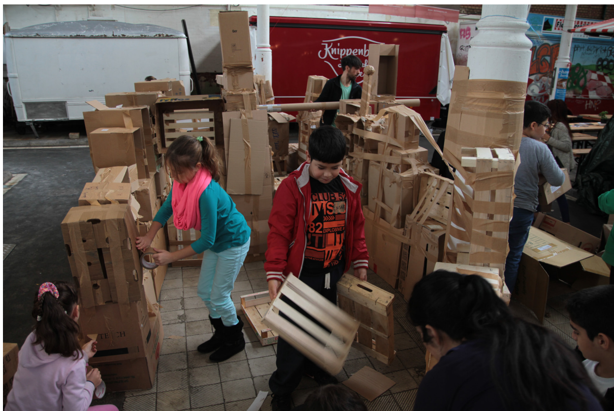
Workshop at Market Hall #9