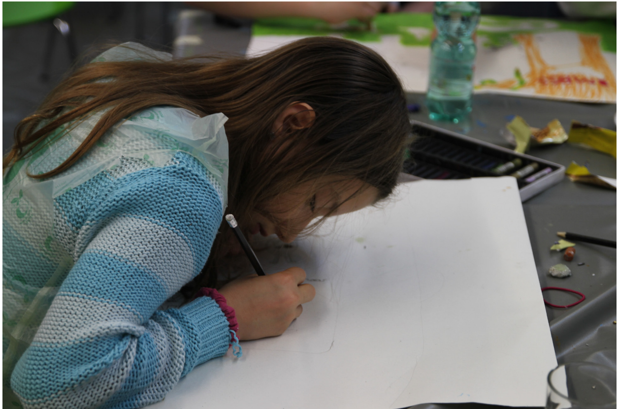
At the workshop