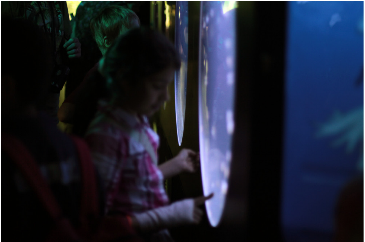
At the Zoo Aquarium