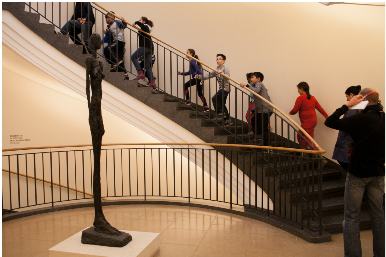
Tour of the Berggruen Collection