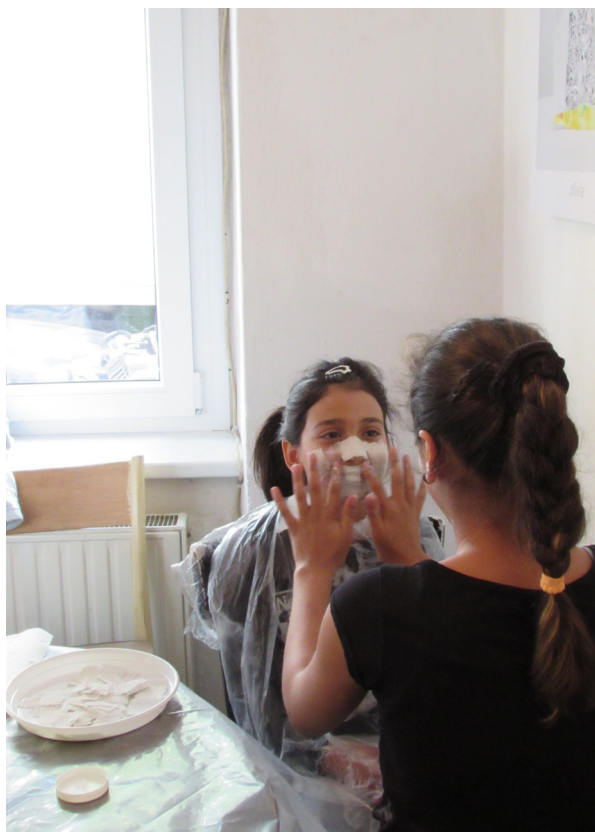
Mask workshop