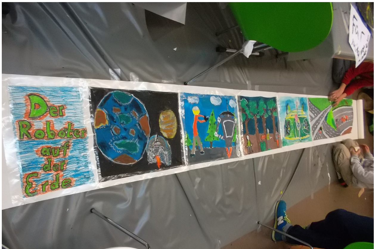
The film roll / Photo: Yam Benyamini