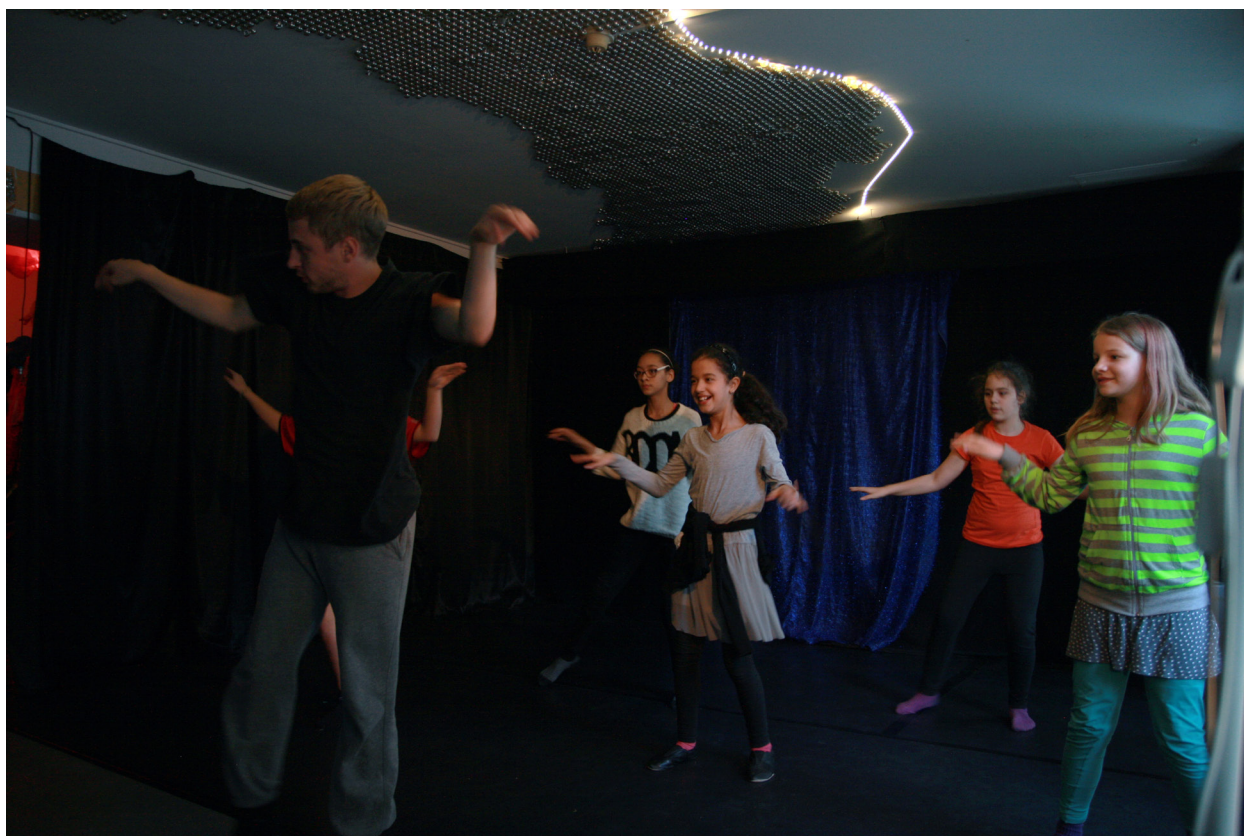
Choreography workshop