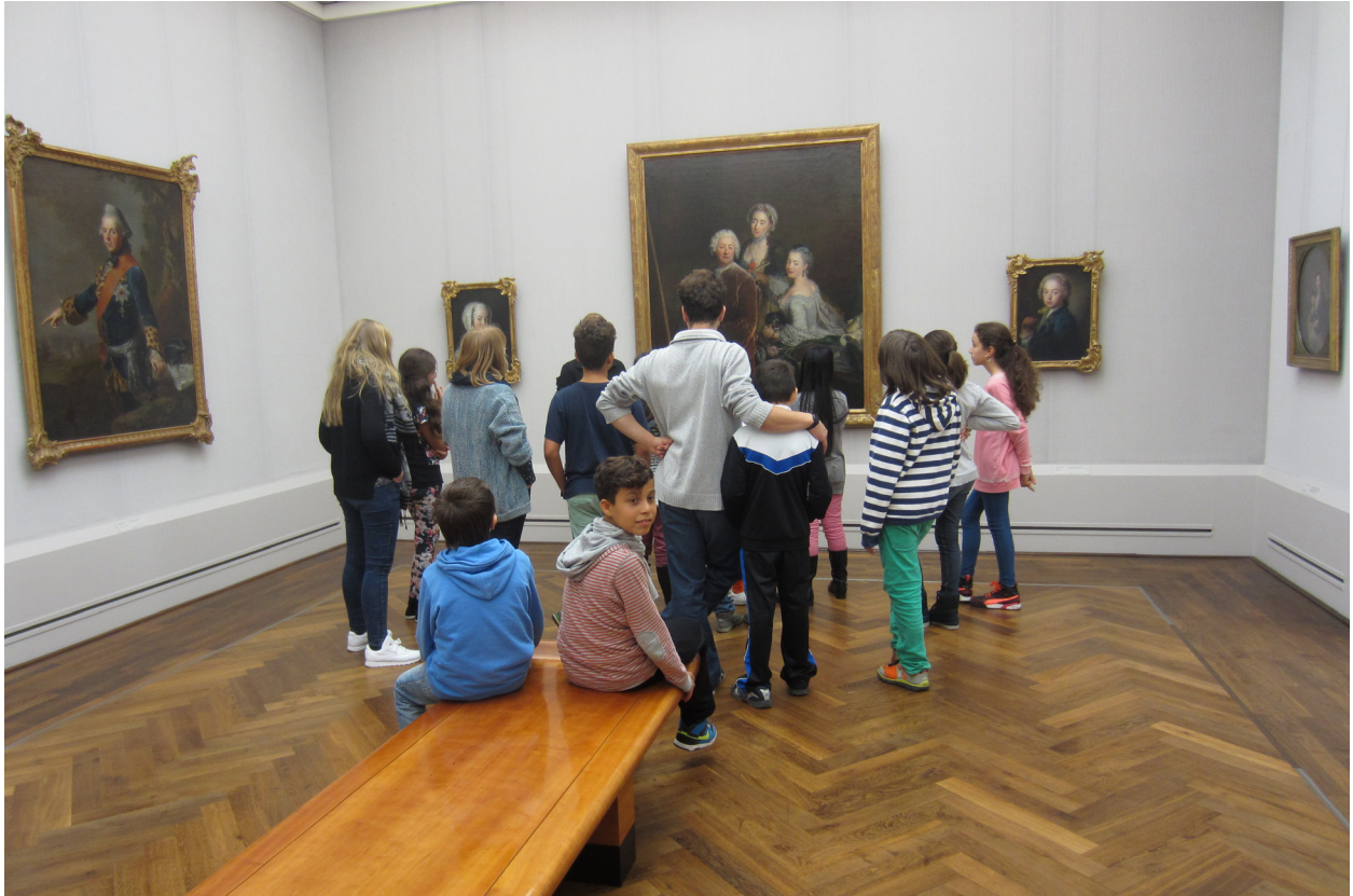
Tour of the Gemäldegalerie