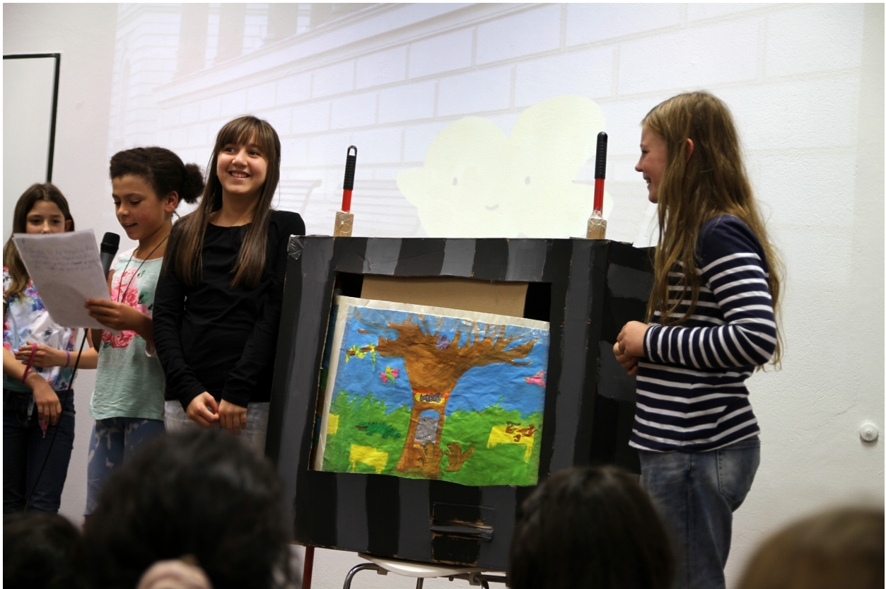
Presentation / Photo: Dora Csala