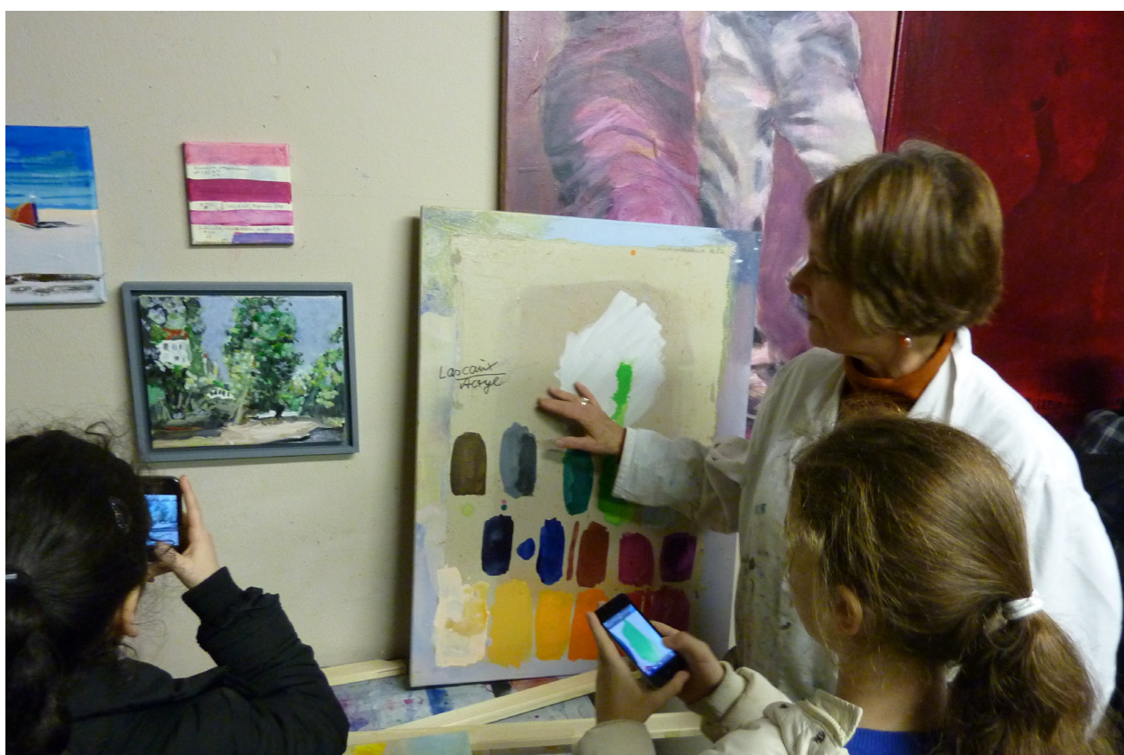
At the artist's studio