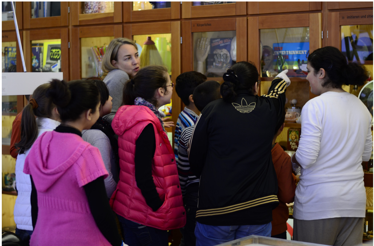
Tour of the Museum of Things