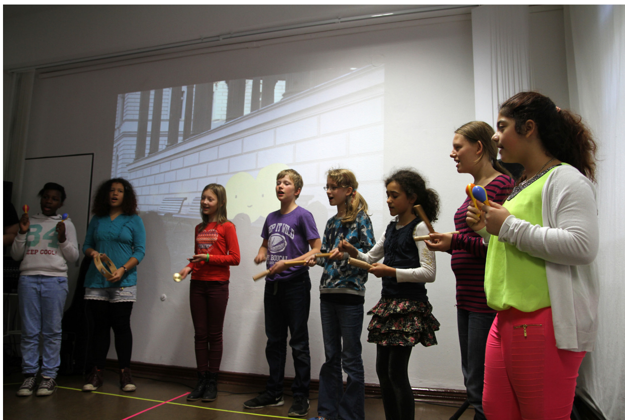
Performance 2014 / Photo: Dora Csala