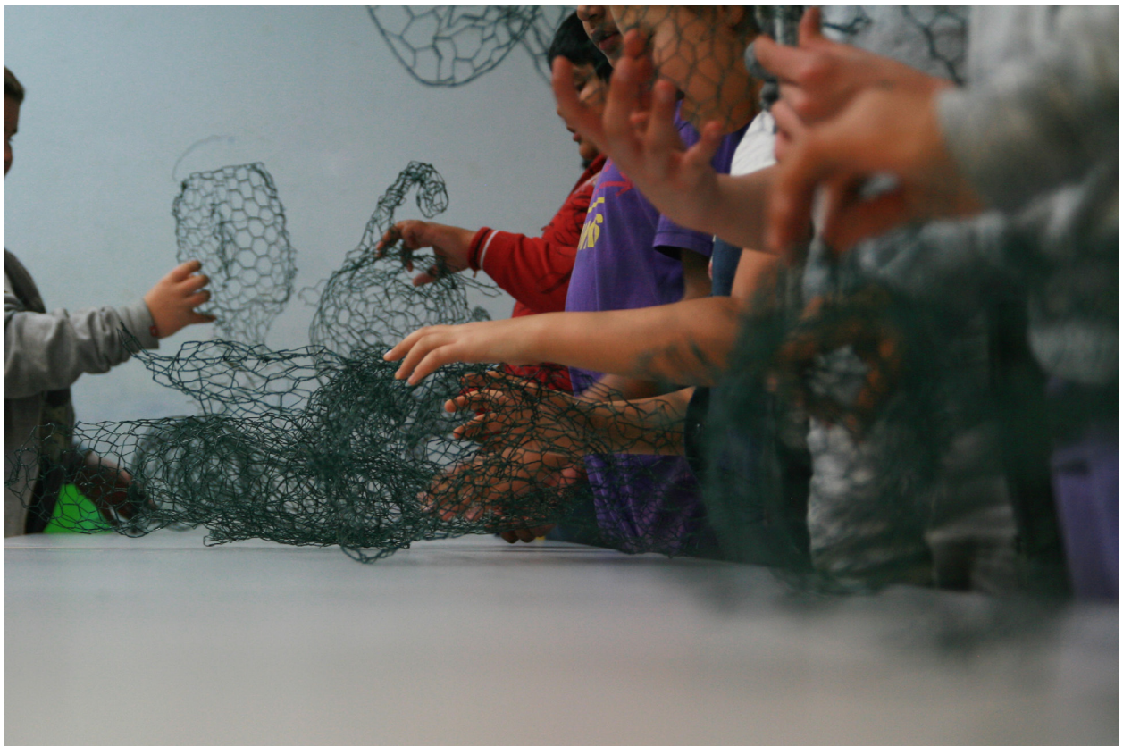
Sculptures in the making