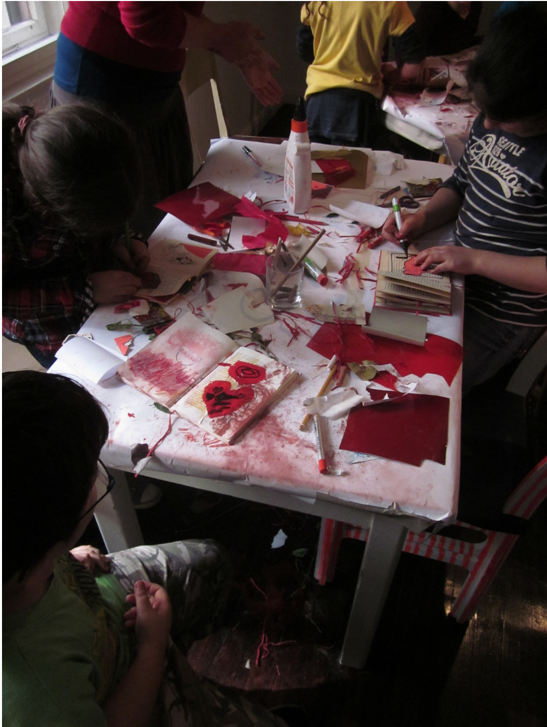
The busy table of the workshop