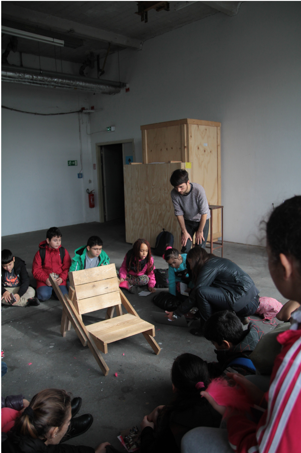
At Raumlabor Berlin