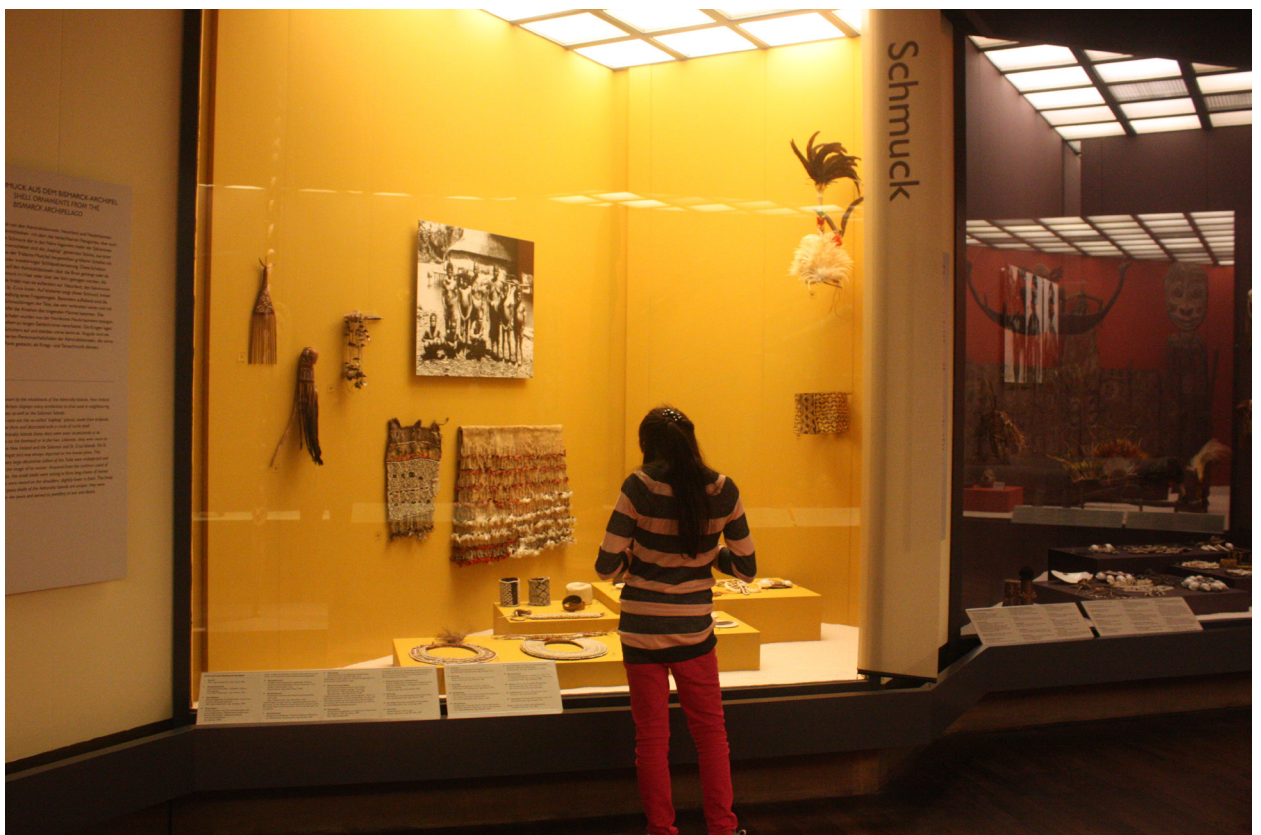
At the Dahlem State Museum