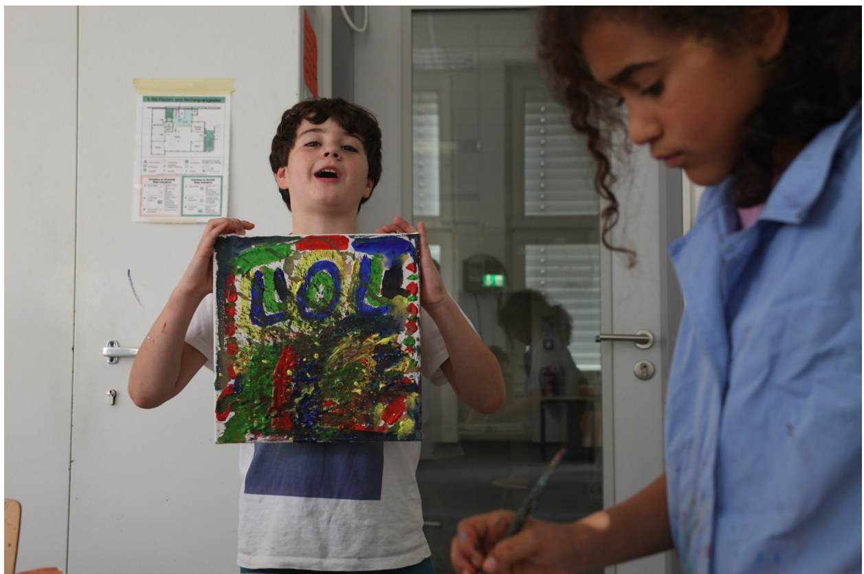
A final piece at the workshop