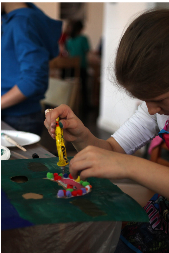
Mask workshop / Photo: Ino Varvariti