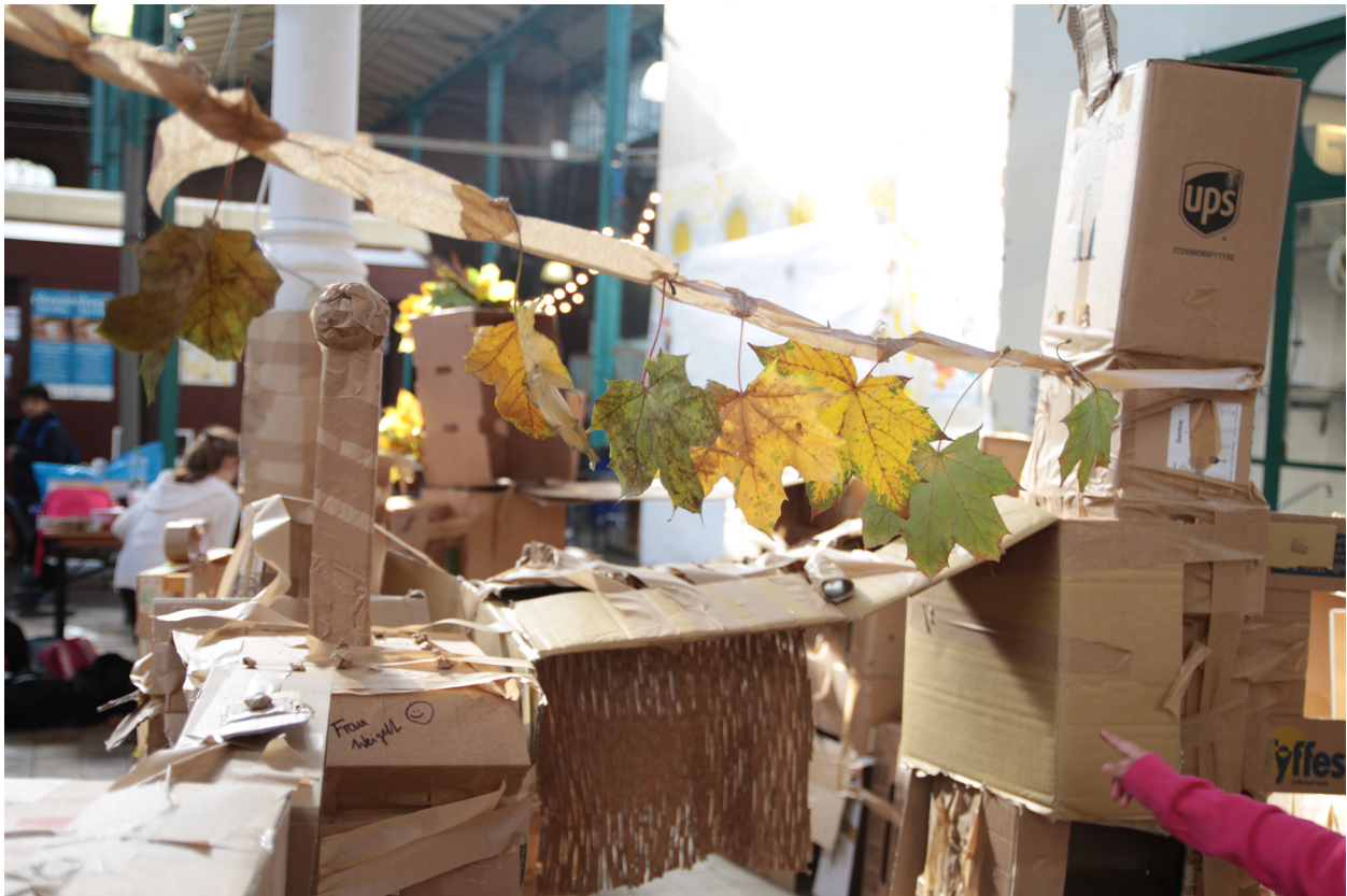
The final piece at the Market Hall #9