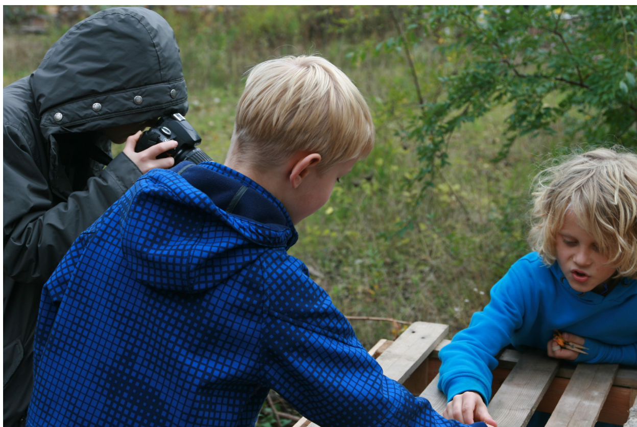
Workshop 2