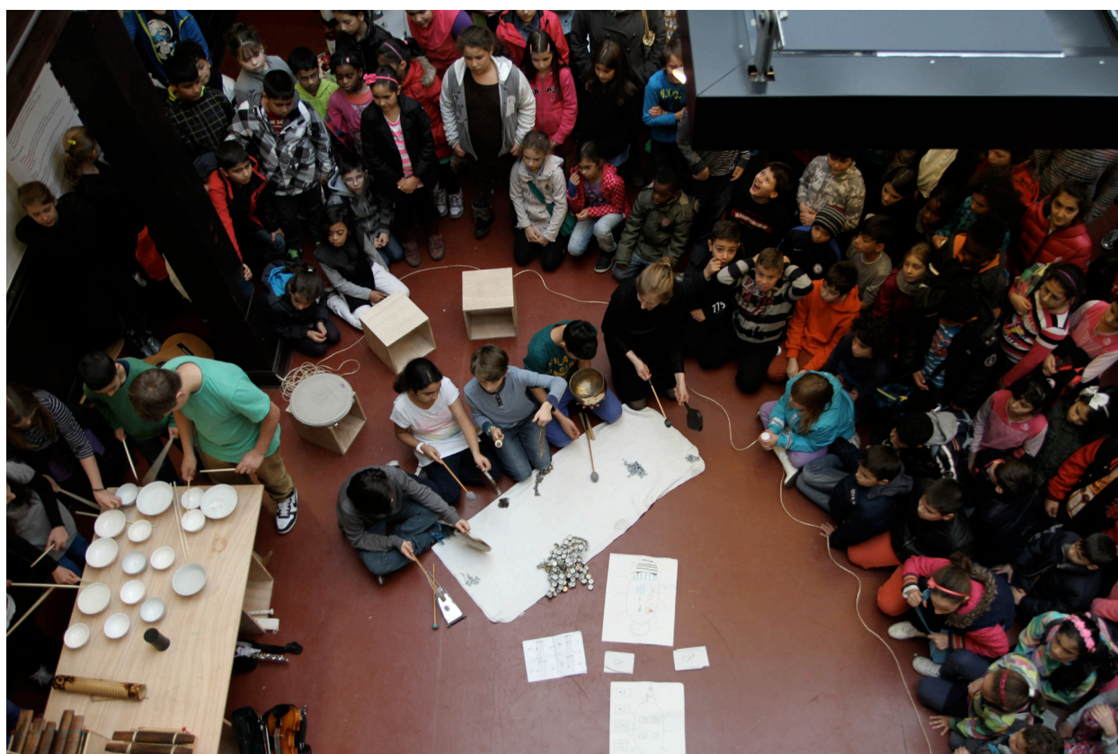
Performance 2013