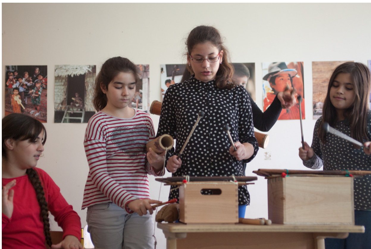
Sound workshop