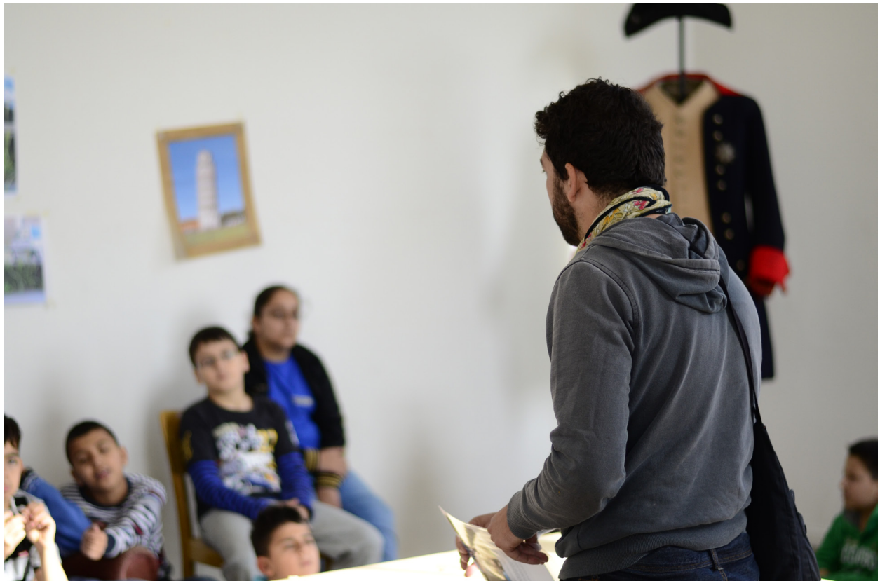
Visit to an artist's studio at Bethanien