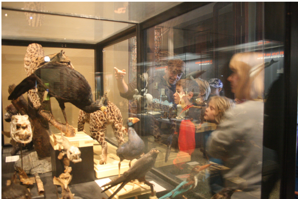
At the Museum of Natural History