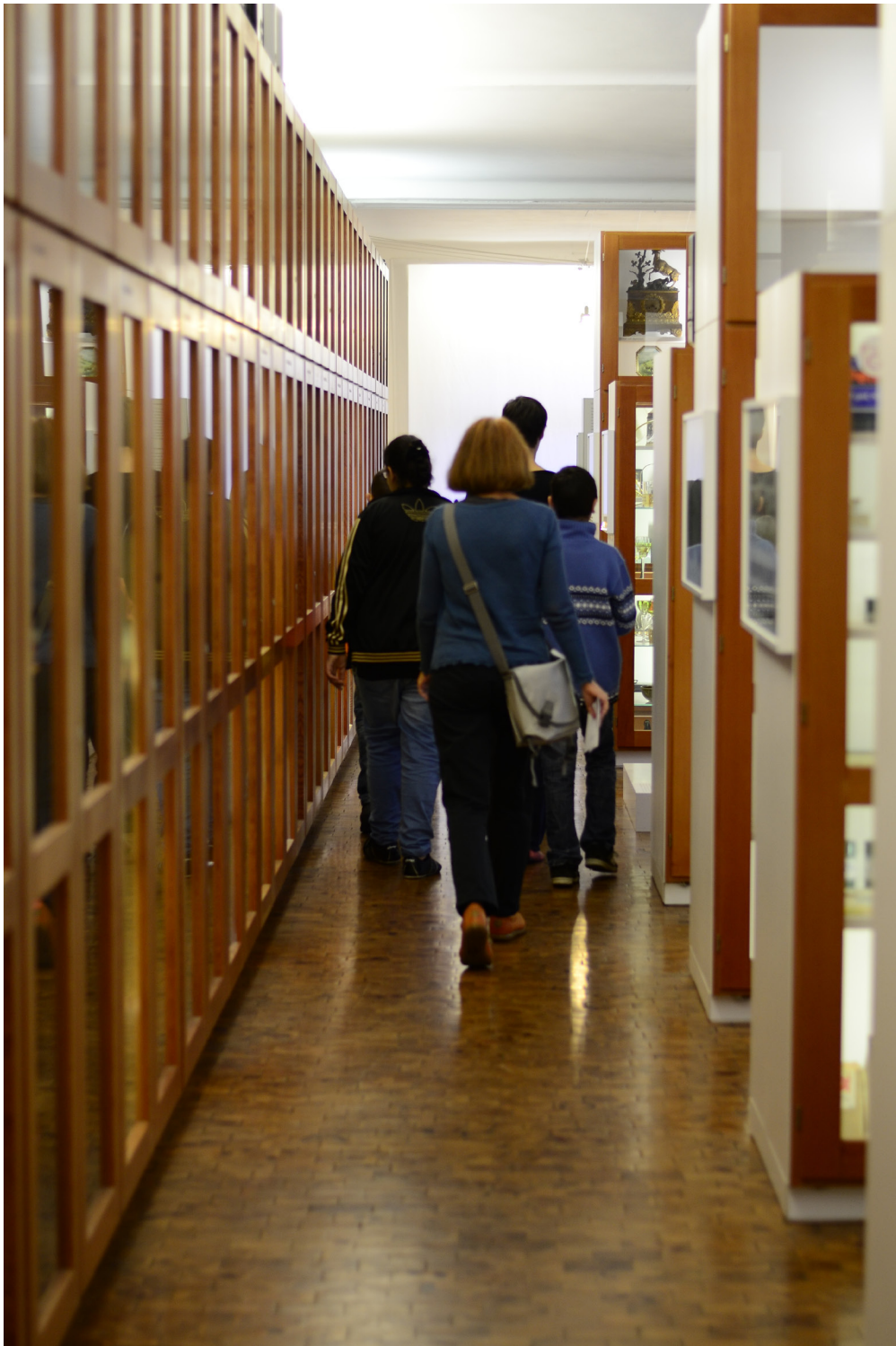
Tour of the Museum of Things