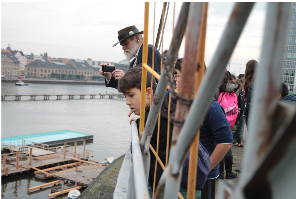
On the roof of Raumlabor Berlin