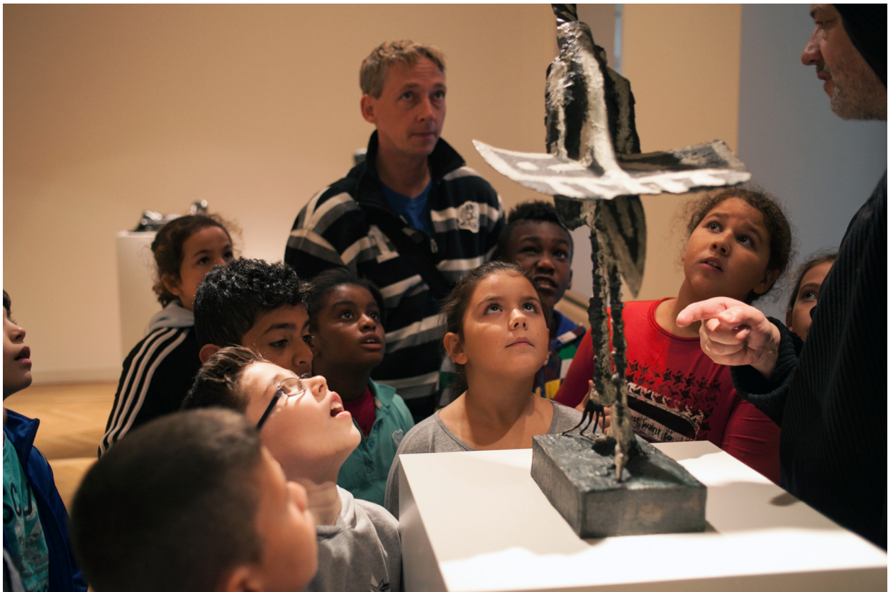
Tour of the Berggruen Collection