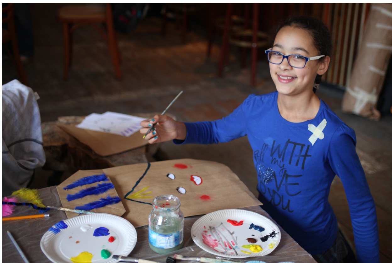
Mask in the making