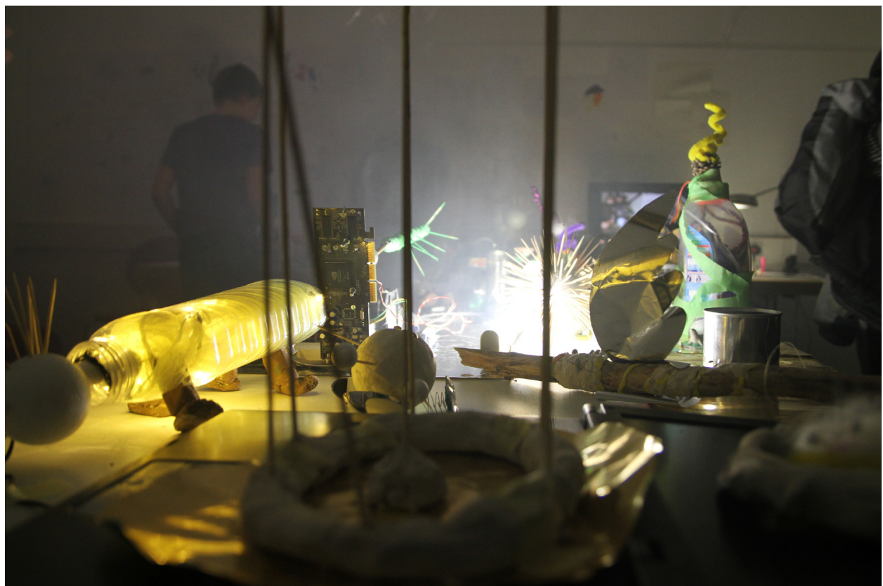
Exhibition / Photo: Dora Csala