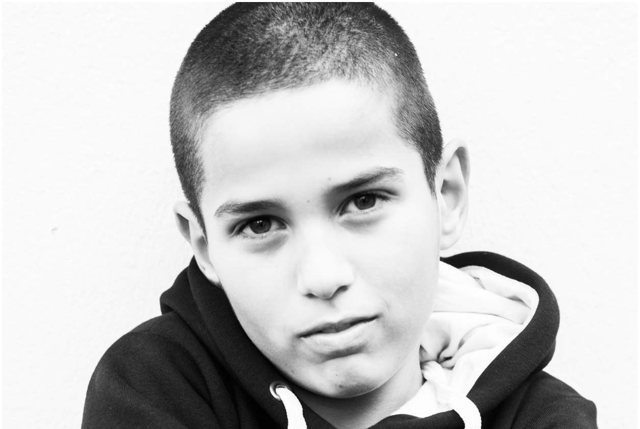
One of the original photographs