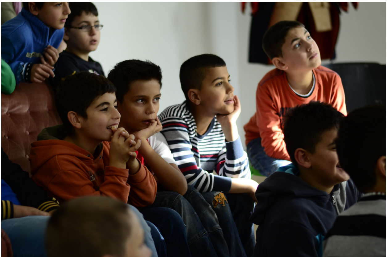
The group at Bethanien