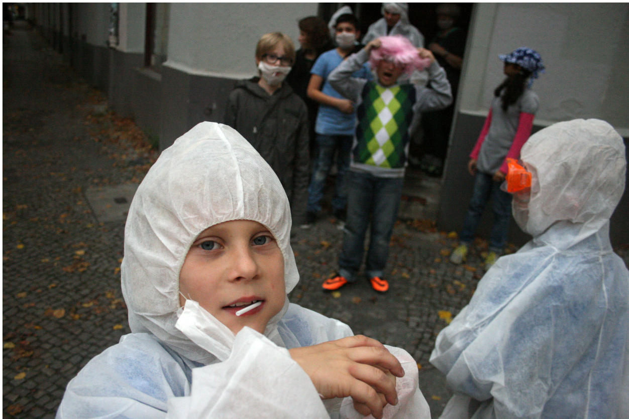
The scientists