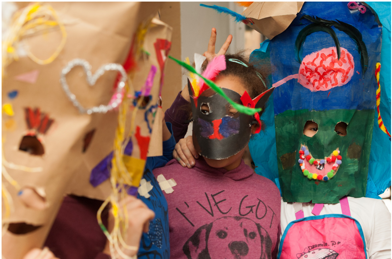
Final masks and costumes