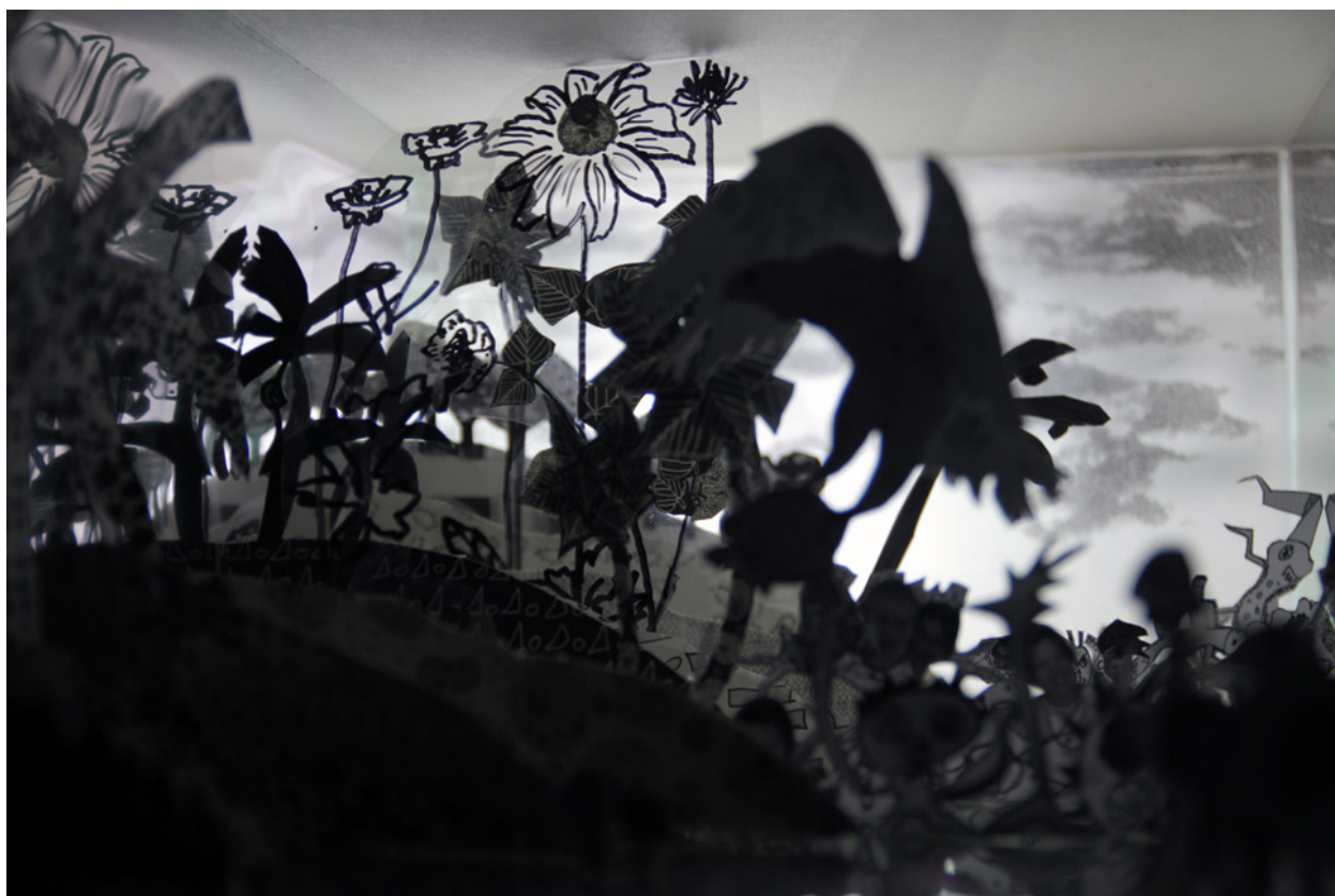
Light - box 2